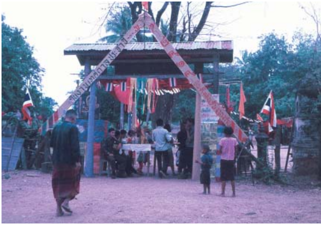
Fig. 1. Village Temple Gate, with a sign, in Thai: “Nay Ngaan Thesakaan Phrachampii— P.S. 2515—Yin Dii Thaun Rap Thuk Thaan” (To the annual village festival—B.E. 2515 [C.E. 1972]—All people are welcome)

decorations, such as bamboo models of birds and flowers, allude to the forest in which Vessantara and his family reside during their exile. Other items, such as long, dangling strings to which grains of uncooked white rice are glued, are said to be solely decorative. On the day before the festival, each household prepares or commissions a plate on which two conical structures made of banana leaves ( khan maak beng ), thirteen pairs of small flowers and incense sticks ( khan haa and khan baet ) and two long candles are arranged. 14 These plates of offerings are placed on the haan Phra Phut and define the sacred space within the khet parimonthon as the space in which the community comes together.