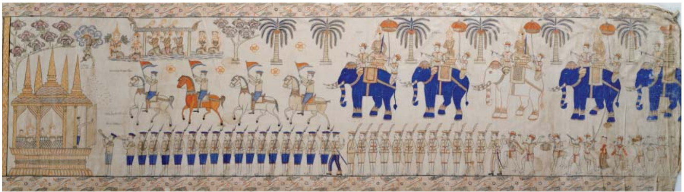
Fig. 19. Panel 13, from scroll 35.256

their gender riding with them, paralleling their travel to the forest (panel 3) with an unidentified angel.