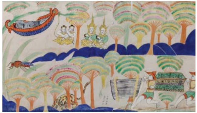
Fig. 15. Interpolated panel 9a, from scroll 35.258