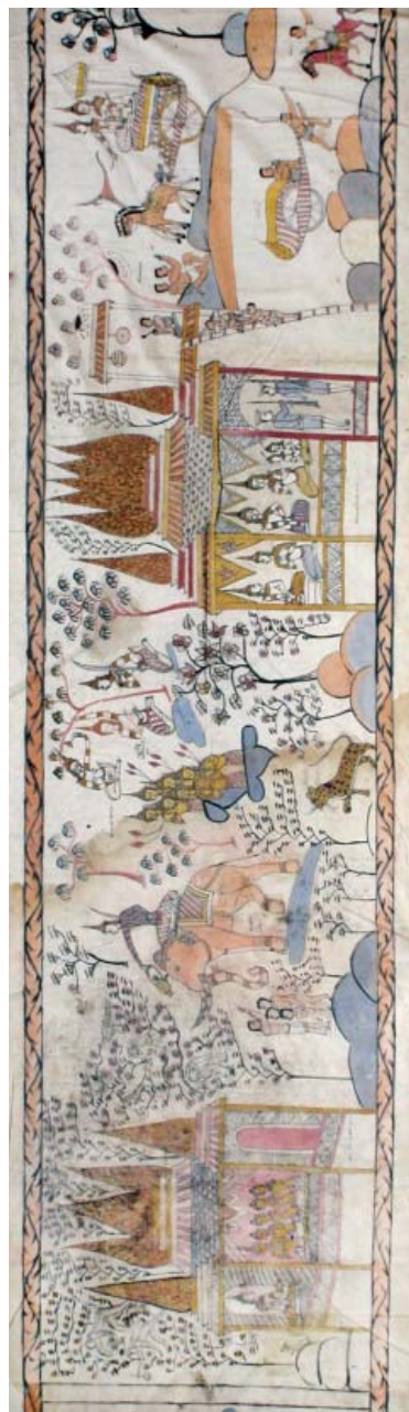
Fig. 8. Panels 1–4, from scroll 35.287