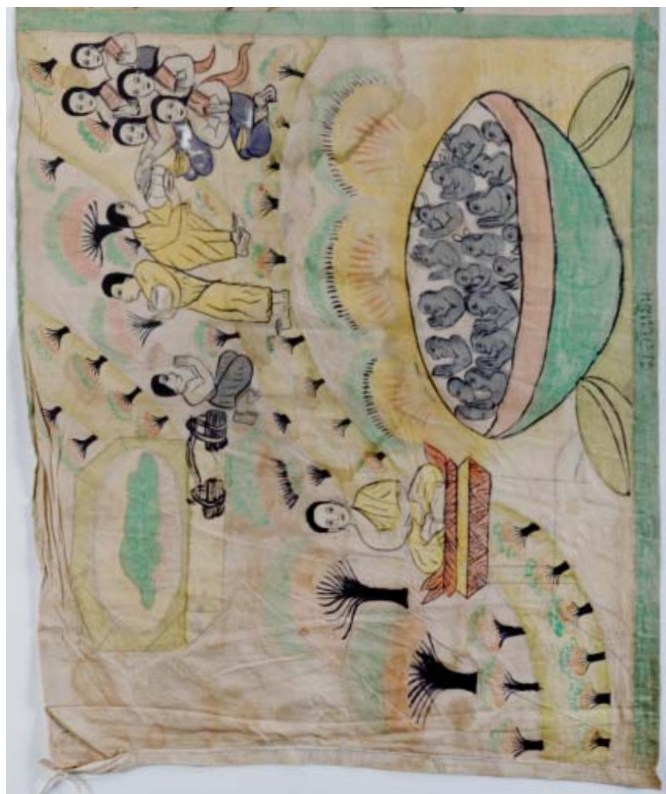
Fig. 6. Panel. Phra Malai visiting hell, panel from scroll 35.258