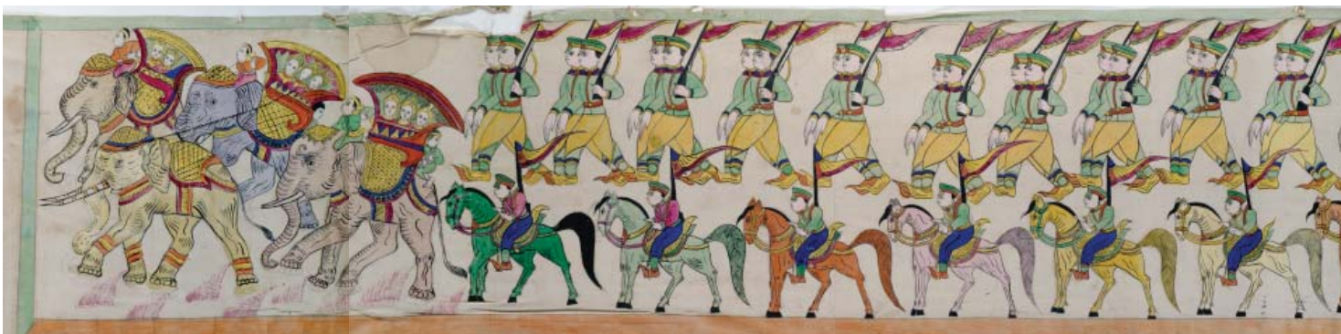
Fig. 20. Left half of panel 13, from scroll 35.258

The current display of this textile, high on the wall of the central room of the old Ubon provincial headquarters, permits this effect. While I have never seen a scroll completely encircle the inside walls of a sala , Gittinger’s observation that the scroll and the story end where they begin is an apt observation. Steven Collins notes, “In the abstract perspective of Buddhist systematic thought the real tragedy of everyday happiness is simply to be in time, to be in a story at all.” 45 The circularity in these scrolls emphasizes that. To follow through on the implications of Collins’s point, nirvana does not occur in the