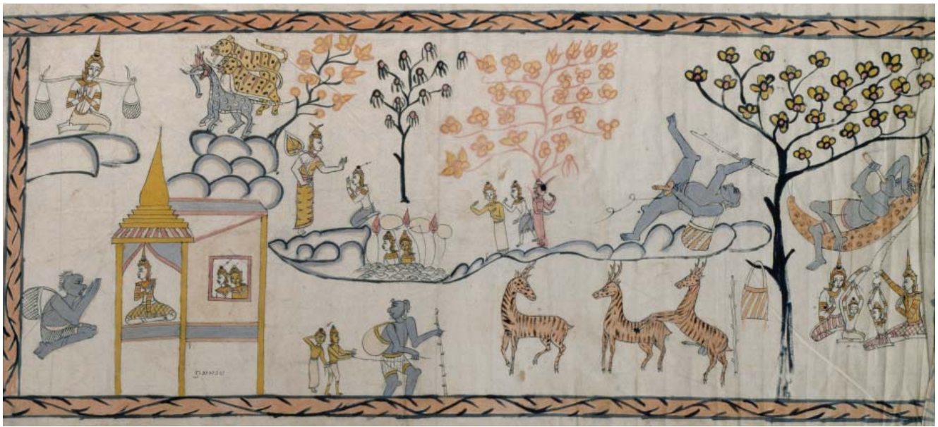
Fig. 12. Panel 8, from scroll 35.287

while carrying baskets suspended from a shoulder pole (a posture difficult to maintain).