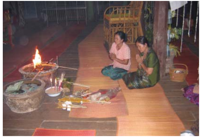
Fig. 2. Sra bookkaaranii and ang nammon in the central sacred area of the sala with sponsors of a recitation, 12 March 2005

Four preaching chairs are brought out and placed at the four corners of this space. Alternatively, a single canopied pulpit is used. At the four corners of the pulpit space are tied a banana tree ( ton kluey ), sugar cane stalk