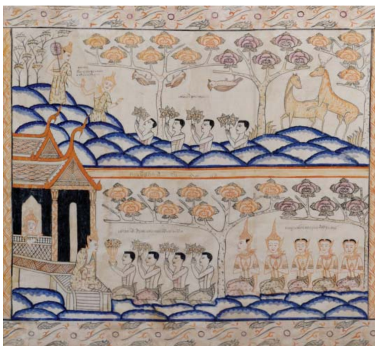
Fig. 18. Panel 12, from scroll 35.256