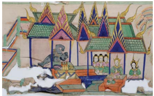
Fig. 17. Panel 10, from scroll 35.258

The depiction of the episode in scroll 35.258 is the least detailed of the three; it includes only two episodes: Chuchok's death and the presentation of the children to their grandfather (fig. 17). (Chuchok's funeral was alluded to in interpolated panel 9A.) Indra's request for Maddi, which one would expect to see represented in panel 9, is represented out of sequence in panel 11. While