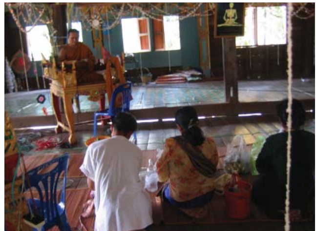
Fig. 21. Sponsors attending Hok Krasat presentation, 9 April 2006

The Jataka story is complicated. Its recitation deserves to be understood and analyzed as performance. The artifacts that accompany the festival and, in the case