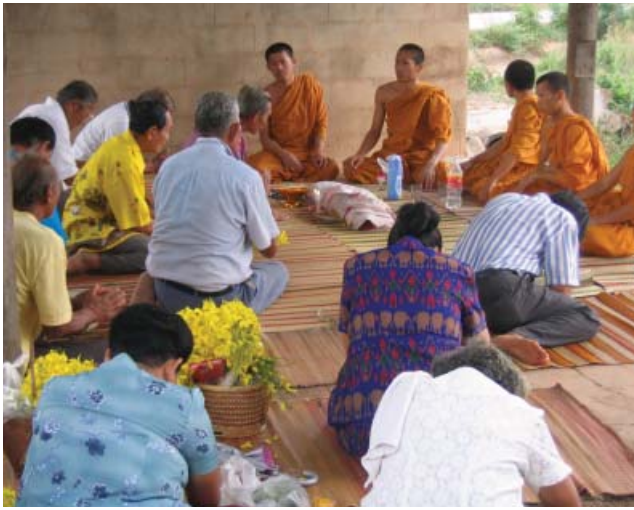
Fig. 3. A rolled Phra Wet scroll on a tray with candles, during the ceremony welcoming Prince Vessantara into the village, 8 April 2006

to the village (fig. 3). 17 The monks and the audience rise, unroll the scroll, and form the procession in which the scroll brings Vessantara and his family back to the village, now become a city. 18