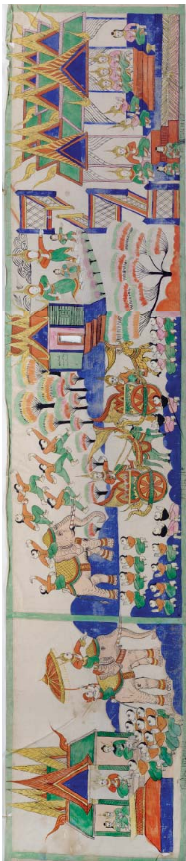
Fig. 10. Panels 2-4, from scroll 35.258.