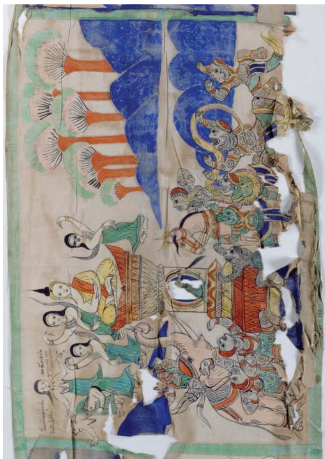
Fig. 7. Panel. Mahavijāra , the Buddha attaining enlightenment, panel from scroll 35.258.