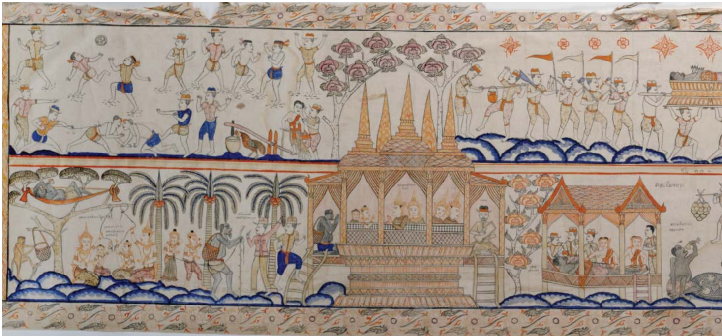
Fig. 16. Panel 11, from scroll 35.256

Chuchok's death due to gluttony. The panel's upper right treats Chuchok's funeral and cremation. The funeral procession is led by two individuals, one of whom may be a monk, the other a novice, wearing robes that resemble those worn by the Buddha and Phra Malai at the beginning of this scroll. 42 The men following the coffin hold flags that will be placed in the ground to help the deceased's spirit find its way to the body, while two men, one of them apparently drunk, carry a jar of rice beer. The cremation scene itself is explicit, showing Chuchok's body (including his exploded stomach) on a bed of flaming coals.