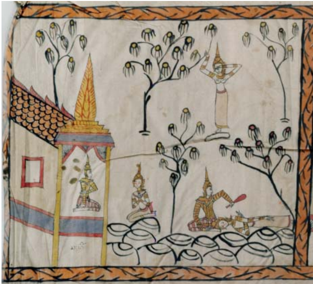
Fig. 14. Panel 9, from scroll 35.287

gift, his wife, without the threat of Brahmin interference which might actually result in Maddi's permanent loss. When Vessantara gives him his spouse, Indra "reveals his identity and returns Maddi." 41 Thus, the text and these two scrolls continue to emphasize the sequence of Vessantara's "perfect generosity" and the fulfillment of his goal. In so doing, they neglect the emotional drama of the children.