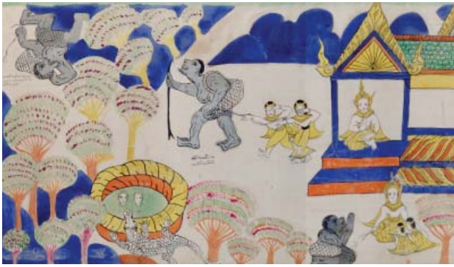
Fig. 13. Panel 8, from scroll 35.258