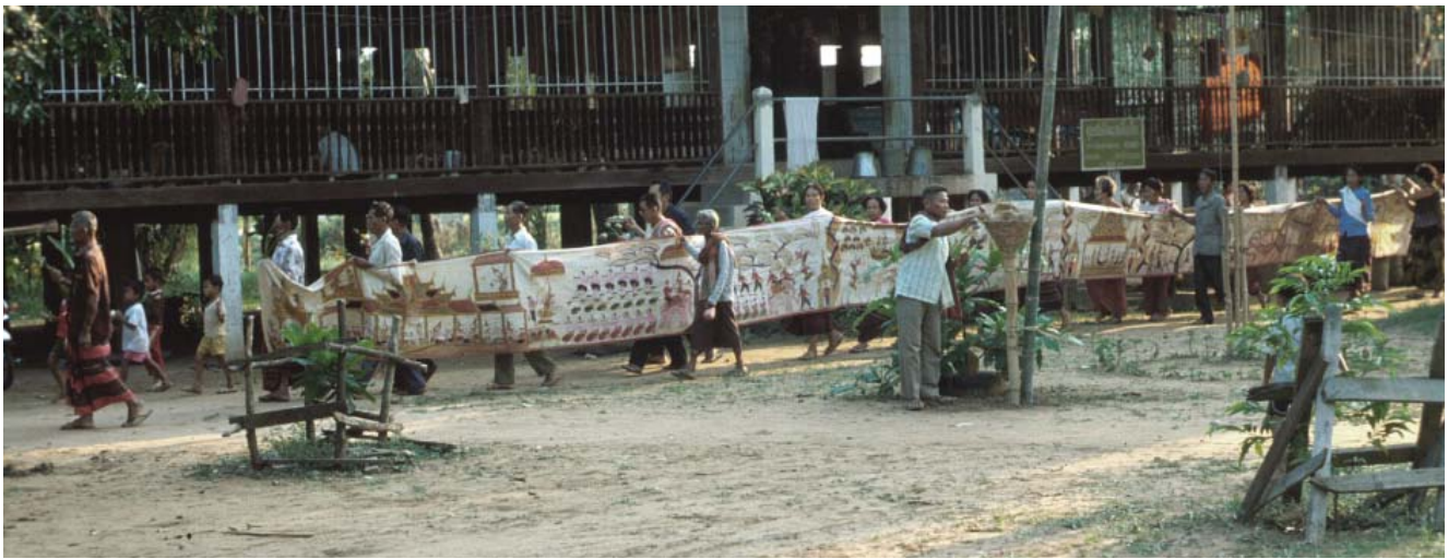
Fig. 4. Procession with the Phra Wet scroll circumambulating the sala wat , 1982

discussed scrolls with many Thai-Lao and examined and taken photographs of several. Finally, I have had the opportunity to devote intensive study to two scrolls in the wat of the village where I have based my research, referred to here by the dates of their donation, Buddhist Era 2537 (1994 C.E.) and B.E. 2544 (2001 C.E.). This material forms the basis of the descriptions and analysis that follow.