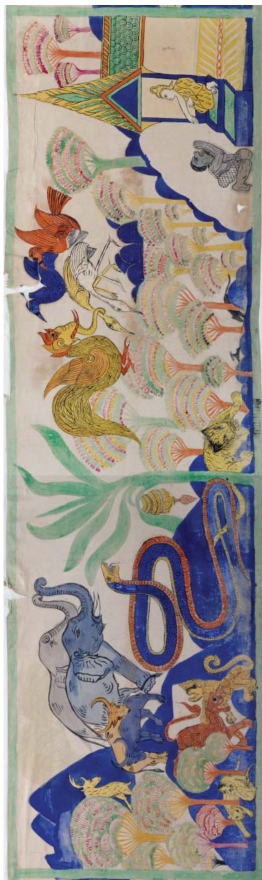
Fig. 11. Panel 7, from scroll 35.258