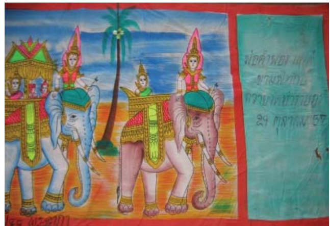
Fig. 5. B.E. 2537 Phra Wet scroll with a donor panel and portion of last panel

Ajaan Pairote associates the use of frames and a perimeter border in wall paintings with an attempt to imitate cloth scrolls. Behind the main Buddha statue in the hall for monks' ordinations ( ubosot ) of Wat Sanuan-waariiwatthanaaraam, Amphoe Baan Phai, Khon Kaen Province, Pairote photographed a double band of the Vessantara Jataka : the first twelve chapters in the upper